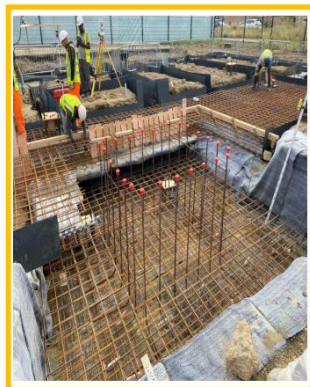
Lift pit reinforcing complete.