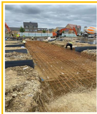
Central foundation rebar tying in progress.