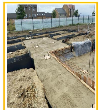
First section of central foundation poured.