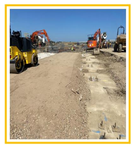
Central foundation reinforcement complete and concrete pour in progress.