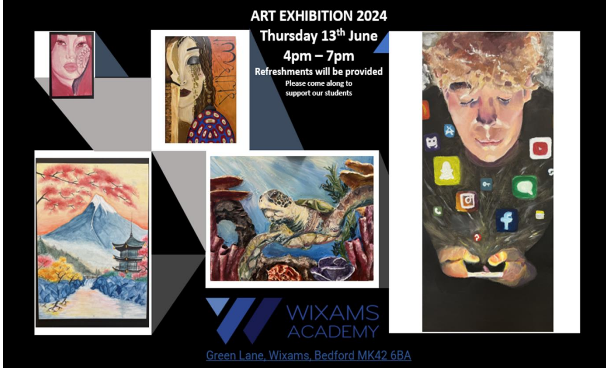
The Art Department is thrilled to announce our upcoming Art Exhibition, which will take place on Thursday, 13th June. This event will showcase the incredible work of our students, highlighting the creativity and dedication they have demonstrated, especially those whose work has been formally examined. The exhibition will run from 4 PM to 7 PM, and we warmly invite you to join us in celebrating their achievements.