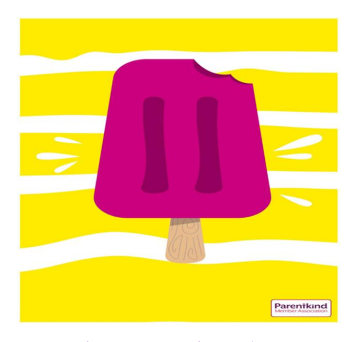
Ice Creams @ Lunchtime on Thursdays-£1.00 Cash Only